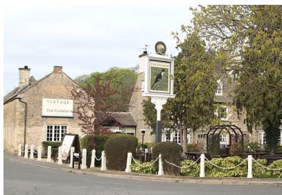
Church Street, Alwalton